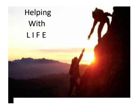
Pine Run Church of Christ

Remember to pray for School Administration