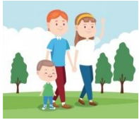
Walks & Talks