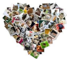
Photo Collages/Memory Books