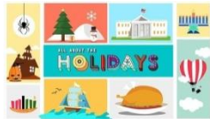
Holidays & Traditions