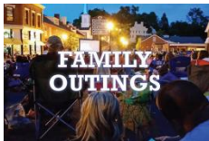
Special Events & Trips